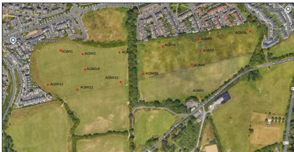
Figure 9.2 Baseline Air Quality Monitoring Locations AQM1 TO AQM15 Dust Levels Tested with DustTrak II Aerosol Monitor 8530.

Note 1: < value indicates below Laboratory limit of detection.