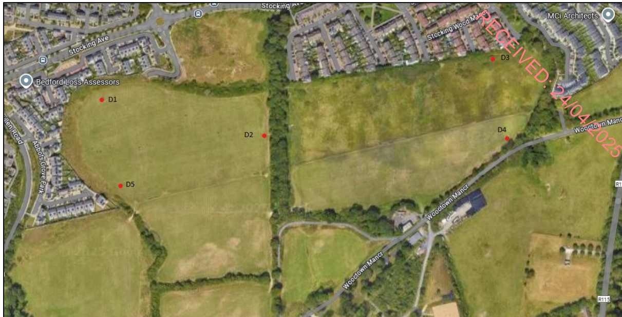
Figure 9.3: Construction Phase dust monitoring locations D1 – D5